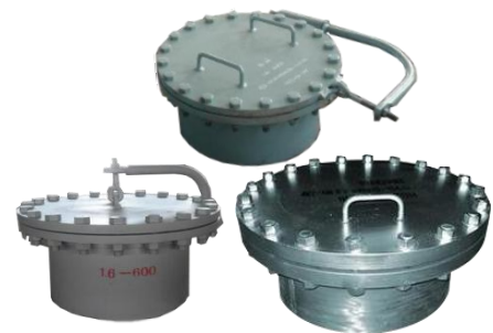
碳钢/不锈钢人孔 C.s/SS Manhole