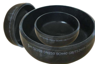
碳钢管帽 C.s pipe cap