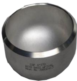
不锈钢管帽 Stainless steel pipe cap